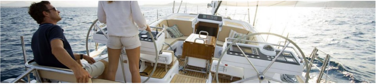
Oyster 625 Yacht Blue Jeannie: winner of the 2012 'Best Luxury Cruiser'award