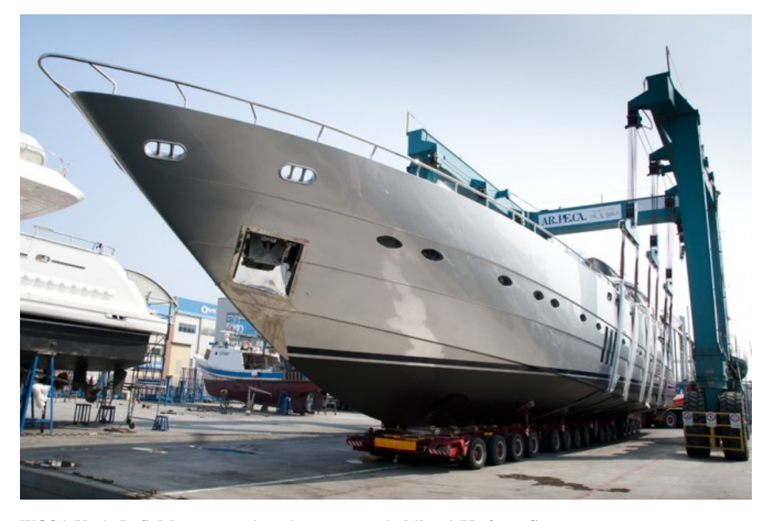
WOSA Yacht Refit Management launches motor yacht Mistral 55 after refit

On the 20th of May this year WOSA Yacht Refit Management launched the Pershing 115 motor yacht Mistral 55, after completing an extensive refit. The 35m superyacht Mistral was originally launched in 2006 by Pershing (A Ferretti Group brand).