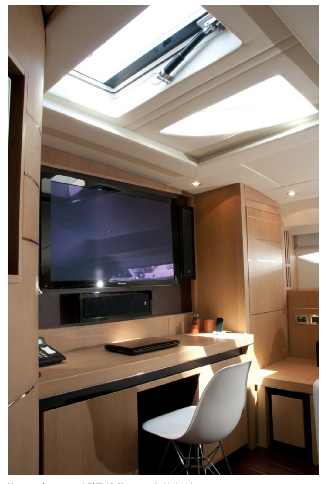
Playroom of motor yacht MISTRAL 55 completed with skylight