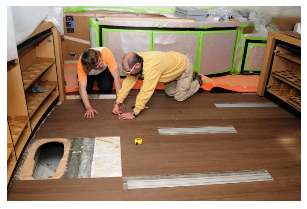
Salon track system for furniture to slide on the yacht Mistral 55

The solution we developed was to remove all the parquet flooring and created a system of tracks on which the lounge furniture and dining table could move forward and aft. This system allows the crew to completely open up the dining area during meals and close afterwards allowing the salon more room. The salon ceiling was also raised to allow for more space.