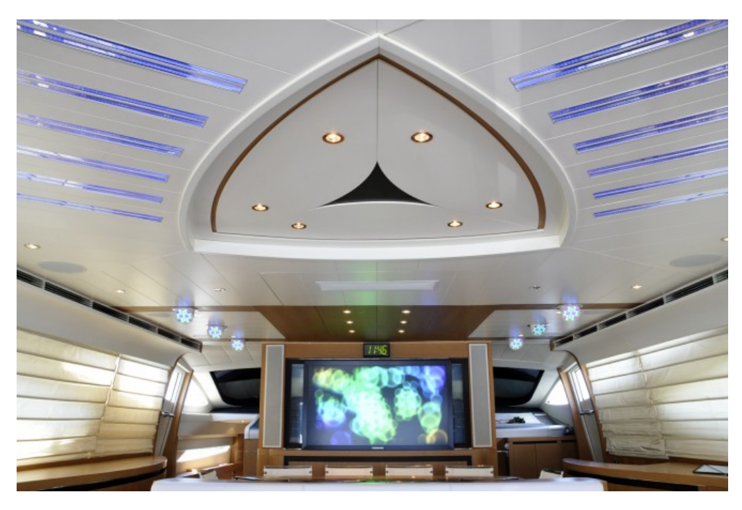
Salon of Pershing yacht Mistral 55 completed in party mode